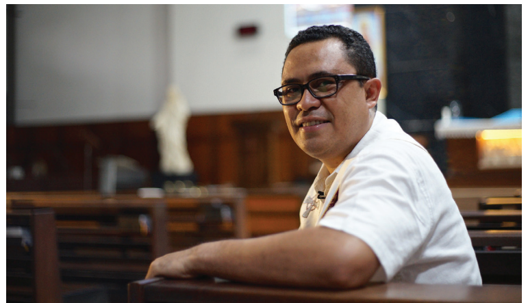
Pastor Roth is a fictional character and not the real name or real photo of a pastor. His story includes elements common to many of the pastors we see.

Two years after his time at Marble, Pastor Roth reached out to let us know that he had just celebrated his first year at his new church and it was going well. Yes, there were still the frustrations that come with ministry but those seemed small as his heart drew from the deep well of being in a ministry for which he was made.