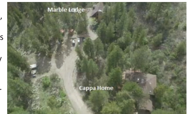
Aerial view of Marble Retreat